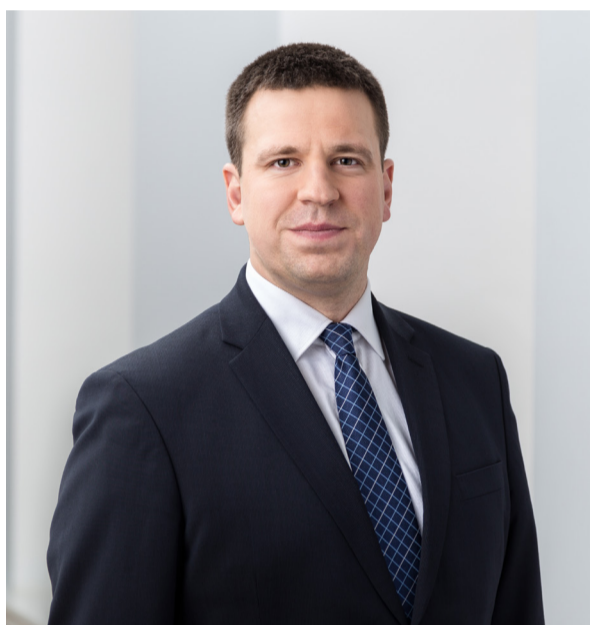
Jüri Ratas Prime Minister of Estonia