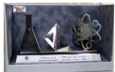
Top 3 in UAE - Grade 4 - TIMSS

Pristine Private School was recognised for attaining a position in the Grade 4 (Year 5) and Grade 8 (Year 9) category among the Top 3 highest performing schools in the UAE for the worldwide assessment, 'Trends in International Mathematics and Science Study' (TIMSS) held in 2015. As part of a new initiative organised by the Supreme Council of Education and Human Resources, the school was presented a special award by HH Sheikh Abdullah bin Zayed bin Sultan Al Nahyan, Minister of Foreign Affairs and International Cooperation, Chairman of the Council. Being recognised at the ceremony spoke volumes about Pristine's long standing dedication and commitment to quality and excellence and its contribution towards the attainment of the National Agenda Targets.