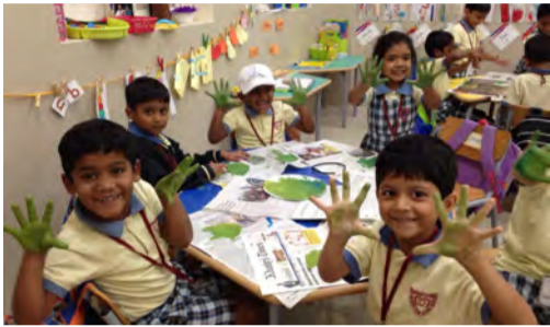
COLOURS: Young ones discover the joy of colouring at the Indian International School, Dubai Silicon Oasis