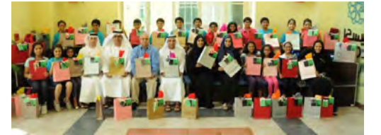
Students with KHDA staff

IHS has undertaken various initiatives in the last five decades that has allowed its students to focus and explore different sectors. It regularly partners with Dubai Cares, Rashid Paediatric Centre, and Al Noor. Such long-term associations have helped students appreciate the importance of giving back to society and lend a helping hand to the underprivileged. Some of the popular programmes and initiatives include: