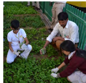
GREEN FINGERS: Gardening in school