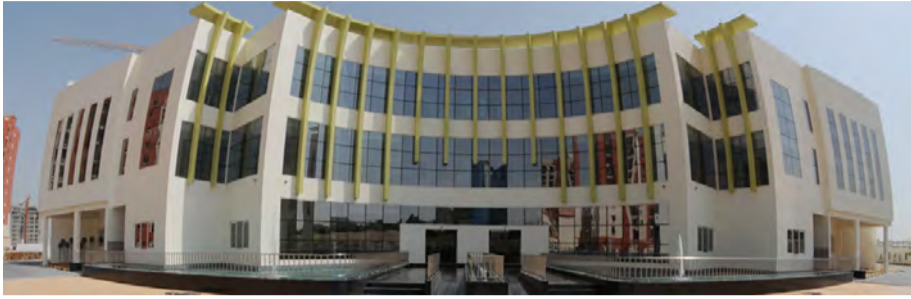
The Indian International School at Dubai Silicon Oasis'