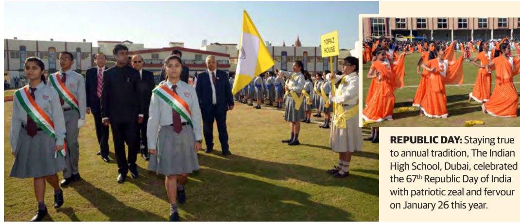
REPUBLIC DAY: Staying true to annual tradition, The Indian High School, Dubai, celebrated the 67 th Republic Day of India with patriotic zeal and fervour on January 26 this year.