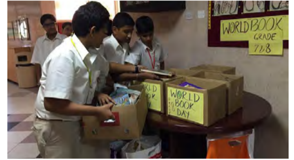
Donating books to local libraries

FIRE SAFETY CAMPAIGN: The school organised a Fireworks Awareness Campaign in collaboration with the General Department of Protective Security and Emergency, Dubai Police.