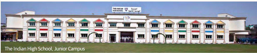
The Indian High School, Junior Campus