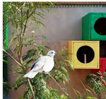
IN TOUCH WITH NATURE: School aviary