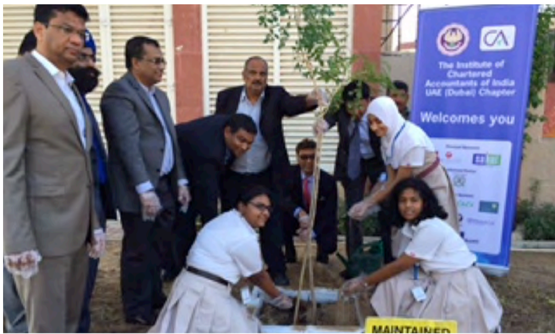
Tree Adoption Day at the school sensitised students on the importance of planting trees, with members of ICAI UAE, Dubai chapter