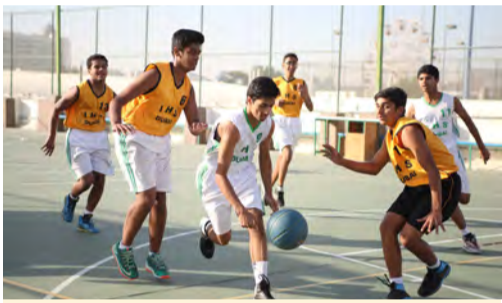
SMASHING WINS: Students get to discover their potential and talent in various sports activities at the school premises