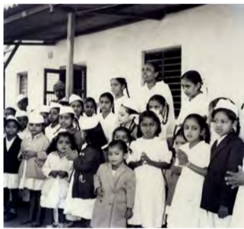
HUMBLE BEGINNINGS: A school assembly in progress in 1961