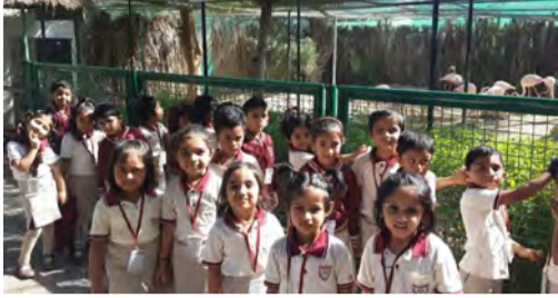
FIELD TRIP: Kindergarten students visit the zoo