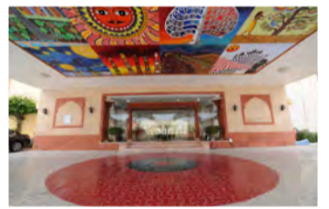
INSET: The school mosaic