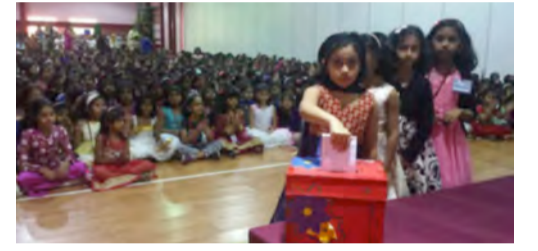
Students dropping money envelopes into Honest Boxes

TEST4GOOD: IHS also enthusiastically participated in the Test4Good programme run by KHDA, where-in students and parents raised Dh50,000 for the Dubai Autism Centre.