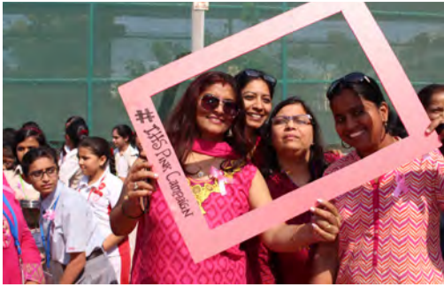
AWARENESS DRIVE: The Pink Campaign at The Indian High School, Dubai