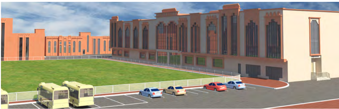
Proposed façade of the Nehru Block (left) and Gandhi Block (right) at IHS